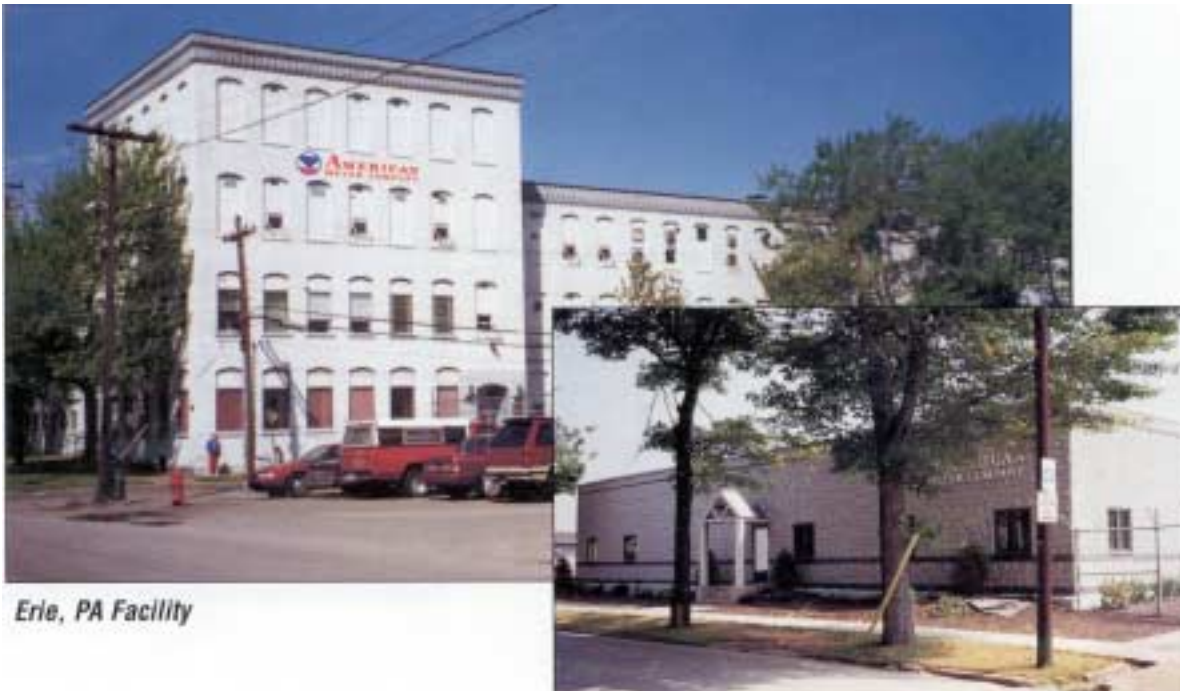
Erie, PA Facility

Your local American or Canadian Meter sales representative would be pleased to discuss further, how these “Remeter” programs offered by the North American Services Group can benefit your current and future business strategies.