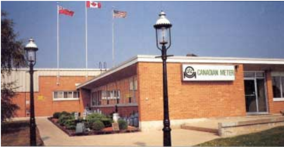
Milton, Ontario Facility

Using the existing and future facilities of these industry leading companies, North American Services Group offers a complete "Remeter" program for all makes and types of aluminumcase, diaphragm type gas meters; Reverify, Refurbish, RefurbishPLUS and Remanufacture.