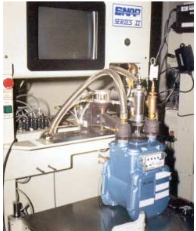
SNAP Prover - Residential

Forming an integral part of the North American Services Group meter management program, RefurbishPLUS allows a utility to maximize the yield of meters returned for servicing. Meters which fail the pressure testing process in the Reverification or Refurbishing operation can be processed under the RefurbishPLUS program and put back into service with both long term accuracy and pressure integrity assured.