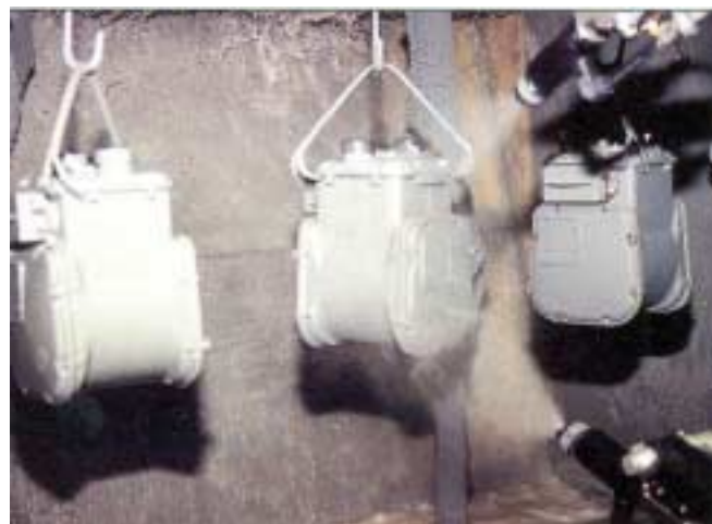
Finish Paint Operation

Commercial meters experience a service life and load profile much different to that of residential or 400 Series meters. As a result, Refurbishing of commercial meters above the 400 class is restricted to vintages fifteen (15) years of age or newer.