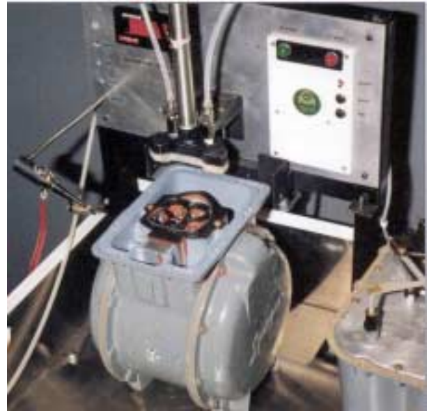
Internal Leakage Test

Meters passing these integrity tests are then processed to completion, including prime and finish paint and the installation of a new lexan index box. Meters that fail the Reverify program are documented and then moved on to the Reverify & Adjust program. Reverify & Adjust is a logical extension of the Reverify program. The meter is “Adjusted” to bring it back to customer defined proof parameters. If the meter cannot be brought in to “Proof” the meter can be moved on to one of the other North American Services Group RE-meter programs.