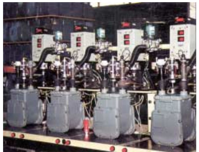
Index and Gearing Checker

Meters passing these integrity tests are then processed to completion, including prime and finish paint and the installation of a new lexan index box. Meters that fail the Reverify program are documented and then moved on to the Reverify & Adjust program. Reverify & Adjust is a logical extension of the Reverify program. The meter is “Adjusted” to bring it back to customer defined proof parameters. If the meter cannot be brought in to “Proof” the meter can be moved on to one of the other North American Services Group RE-meter programs.