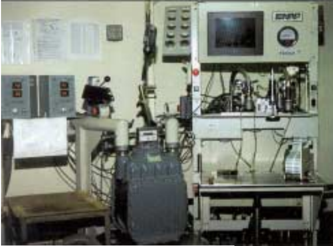
SNAP 800/1000 Prover

The North American Services Group RefurbishPLUS program is designed to meet the needs of utilities wishing to have a level of “below-the-table” work performed. As such, the RefurbishPLUS is designed to ensure that the serviced meter meets the demands of a badged maximum pressure test.