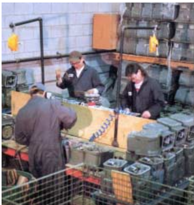
Cambridge Remanufactured Stripdown

For American and Canadian Meter class 400 and above, all parts with the exception of the valve seat are removed and replaced, and like residential, they meet the same criteria and warranties as offered on new.