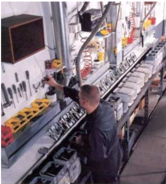
Edmonton Refurbishing Line

The North American Services Group Refurbish program is designed to provide a detailed and complete “above-the-table” repair of residential and commercial and industrial diaphragm type gas meters.