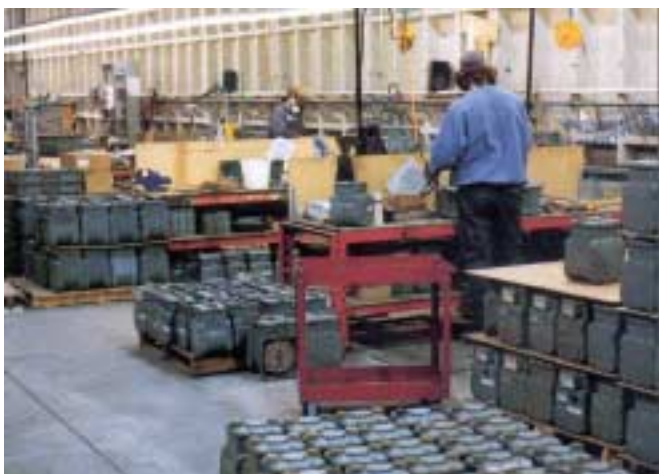
Cambridge Refurbishing Line

All critical meter wear parts which directly affect measurement accuracy as well as pressure retaining components, are replaced with O.E.M or “O.E.M. Equivalent” parts.