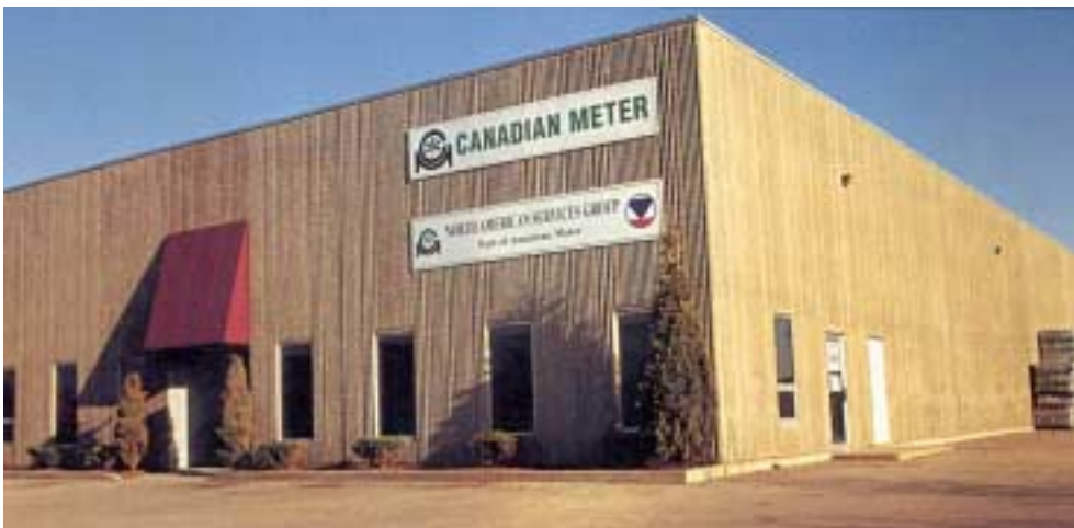
Cambridge, Ontario Facility

In all cases, meters are processed using state-of-the-art assembly and testing techniques. O.E.M. or "O.E.M. Equivalent" parts are used exclusively and in all cases, programs are clearly and completely identified and consistently performed. There are no selective repairs and no surprises.