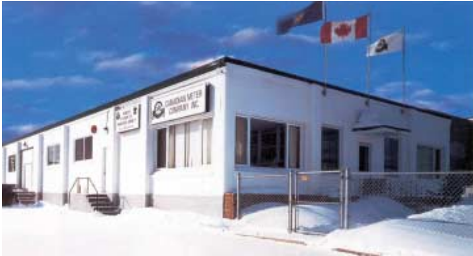
Edmonton, Alberta Facility

Utilizing the state-of-the-art facilities of the American and Canadian Meter group of Companies, these programs offer tangible cost savings, while ensuring the highest level of measurement integrity. All this, plus the environmental benefits the “Remeter” programs offer, equals a unique and flexible way of maximizing the benefits and potential of any meter population.