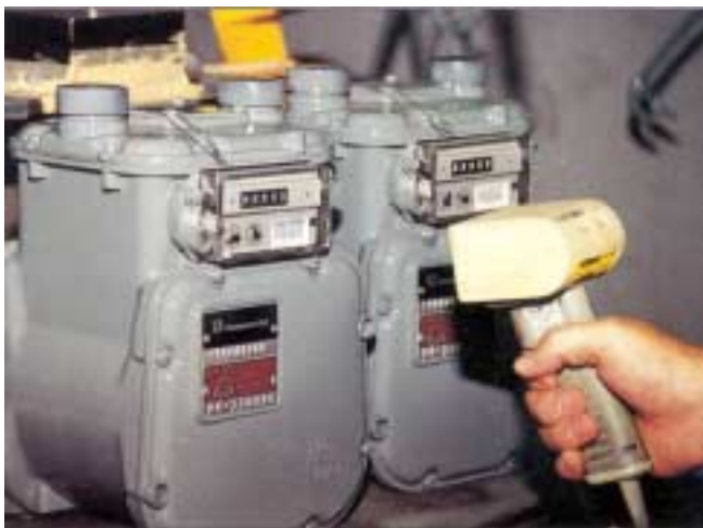
Bar Coding Scanning

Like Refurbishing , RefurbishPLUS uses O.E.M. or O.E.M. equivalent parts and carries a one (1) year warranty. All parts and processes included in Refurbishing make up a fundamental piece of the RefurbishPLUS program. In addition, meters are pressure tested to the badged maximum working pressures.